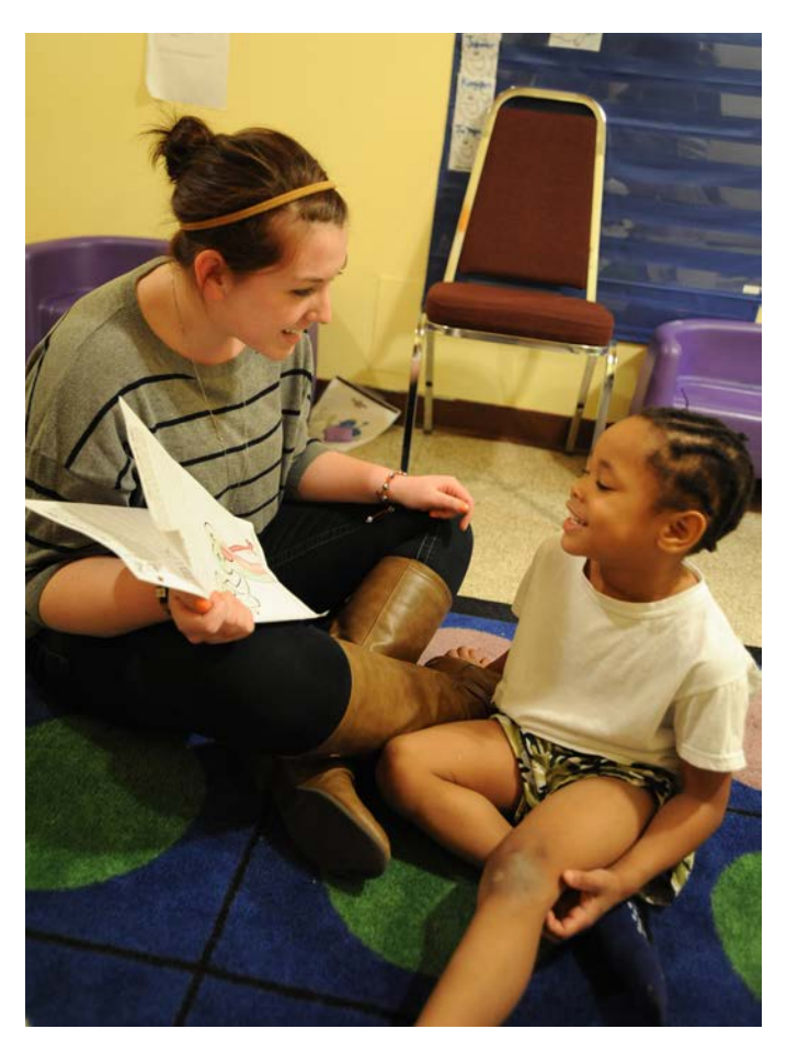
Project CATCH works closely with children who enter shelter to identify any developmental delays and connect them to services such as therapy.

staffing resources, the mental health and developmental needs of the youngest children—who had often suffered repeated upheaval and trauma—were not being effectively addressed."