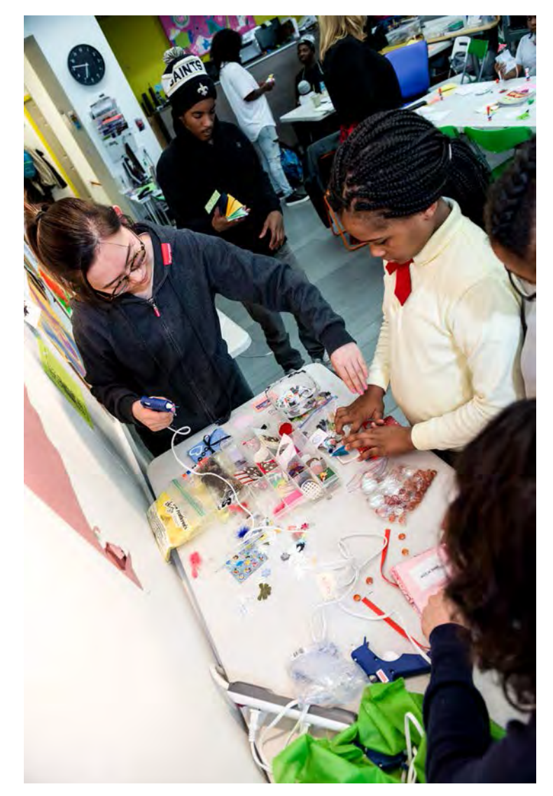
Project Create classes like the one shown in this photo aid in the development of life skills such as collaboration, teamwork, and problem solving.

Wards 7 and 8 located east of the Anacostia River. The poverty rates there are extremely high — 40 percent and 50 percent, respectively, of households are living below the poverty line. (The federal poverty line is defined as a household income of $24,000 per year for a family of four.)