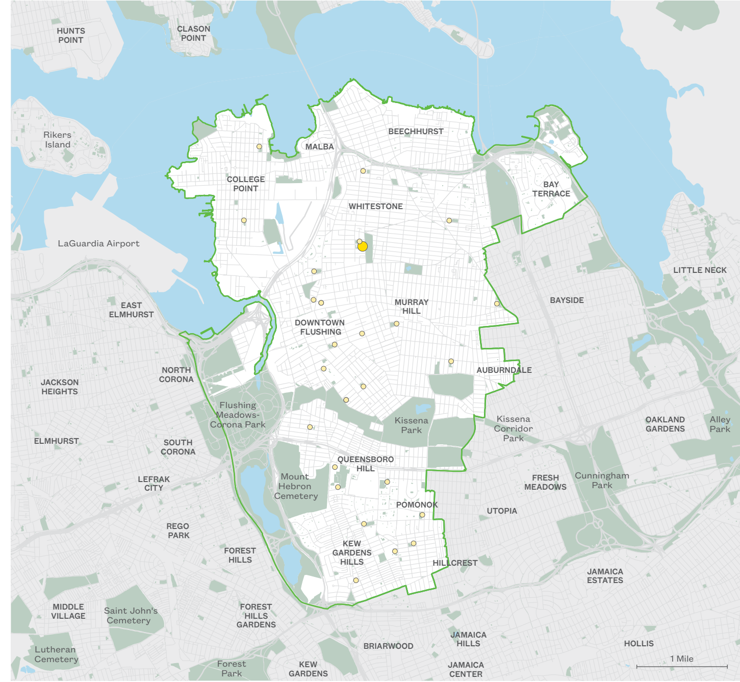
Note: In order to protect student privacy and adhere to the Family Education Rights and Privacy Act, schools with fewer than 10 homeless students are excluded from the map.