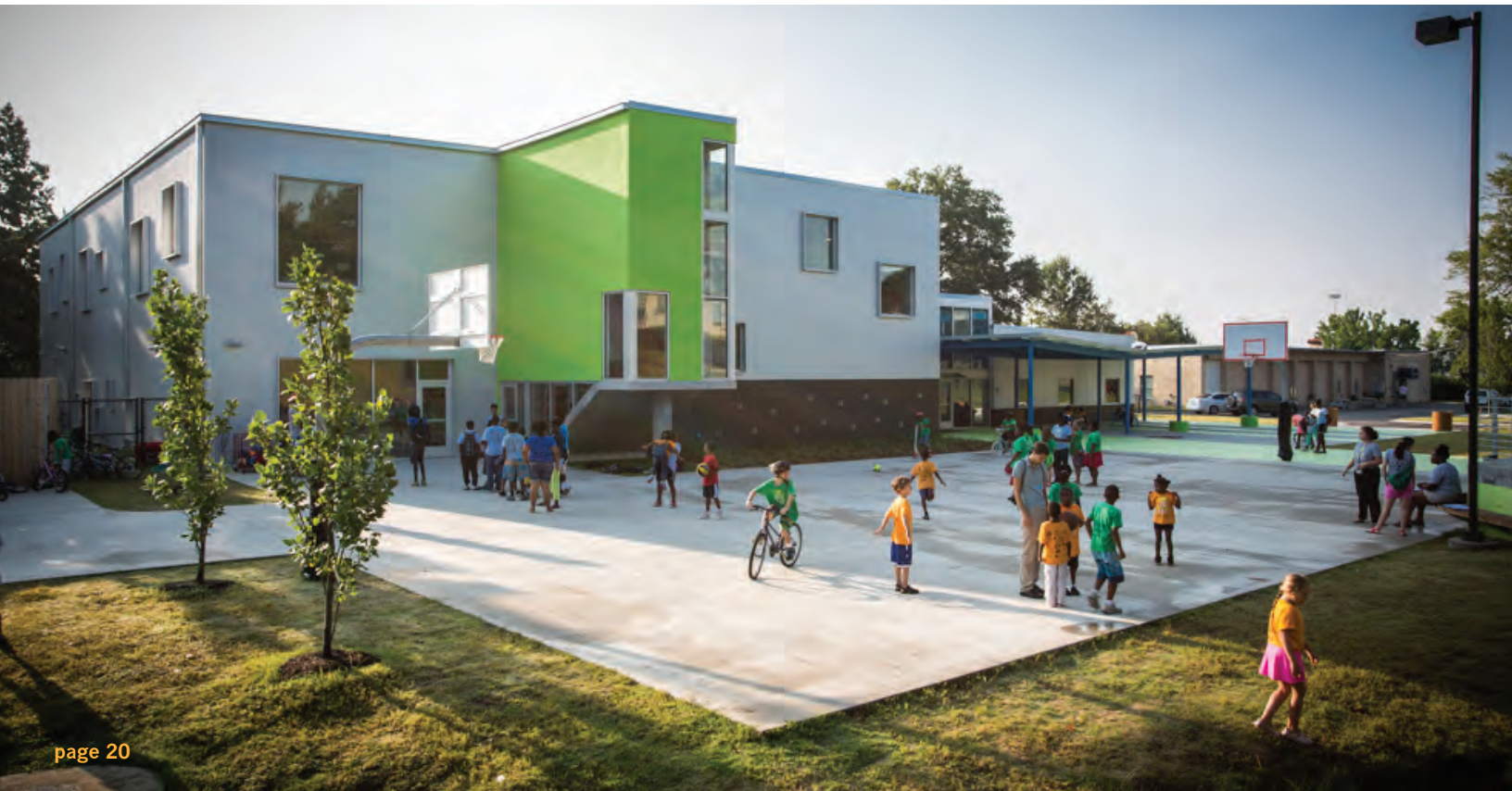
Below right: Whenever possible, programs for both parents and children are coordinated to ensure that all family members are engaged and learning.